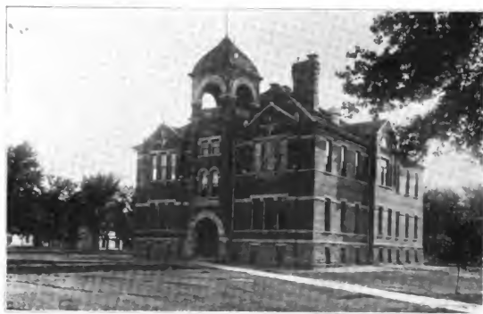
GRADE SCHOOL BUILDING, GARNER